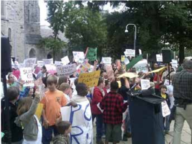
More Charter School Supporters rallying downtown